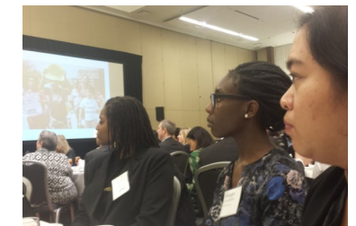
Apprentices attend annual LCCR MLK Luncheon.